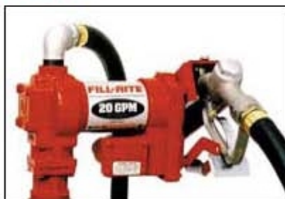
Model 1210C Battery Powered Pump Shown